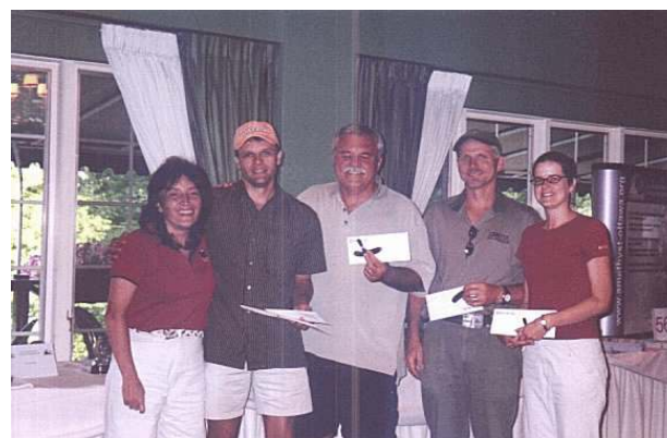
Winning Team - PCL Constructors